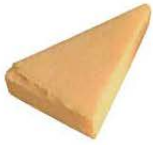
Dairy Cheese, milk