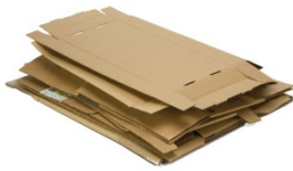
Cardboard (flattened to fit in your recycling bin)