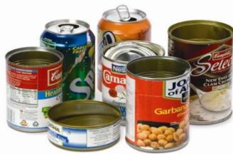
Aluminum cans, steel & tin cans