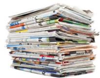
Newspaper, including inserts