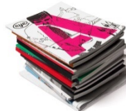
Magazines, catalogs, and telephone books