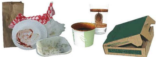
Uncoated Take-Out Containers & Paper Plates

Other unacceptable items: Garbage, cardboard, paper, glass, plastic, aluminum and metal cans and other recyclables.