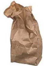
Soiled Paper Bags