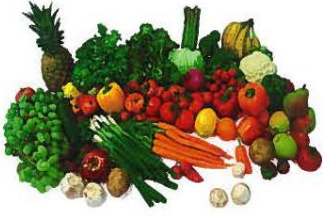
Fruits & Vegetables Juices