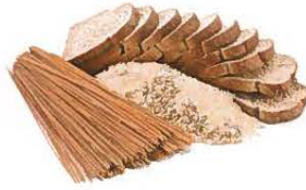
Grains Pasta, beans, rice, bread, cereal