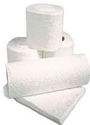
Tissues, Paper Towels, Napkins