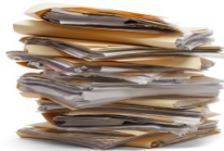
Office paper, junk mail, folders