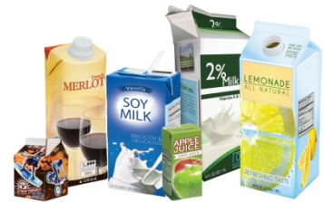
(caps and straws removed)